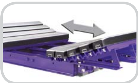
Each half of the bed slides out for easy maintenance.