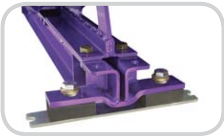
Isolation mounts provide a second level of impact relief.